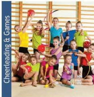
Cheerleading & Games